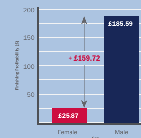
The difference in profitability of male and female British Blue calves