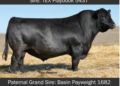
Reg. No. USA19774516 Born 01/09/2019 Birth Weight 32kg Weight 205 days 371kg Weight 365 days 624k Weight 919kgg SS 12 months 38.5cm FS 6.3